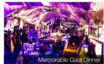
Memorable Gala Dinner