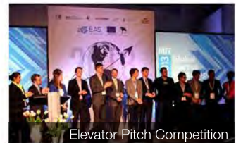
Elevator Pitch Competition